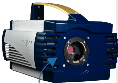
The motorized 8-filter wheel.

Specifications are subject to change without notice. Other configurations are available upon request.